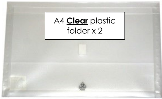
A4 Clear plastic folder x 2