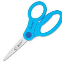
Scissors approx. 17 cm rounded