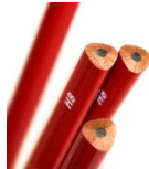
HB lead pencils x 10