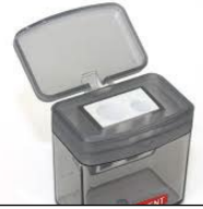
Enclosed sharpener x 1