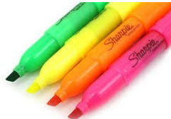
Highlighters pack of 4