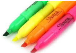
Highlighters pack of 4