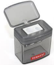
Enclosed sharpener x 1