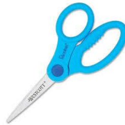
Scissors approx. 17 cm rounded