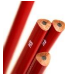
HB lead pencils x 10