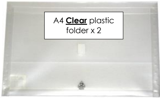
A4 Clear plastic folder x 2