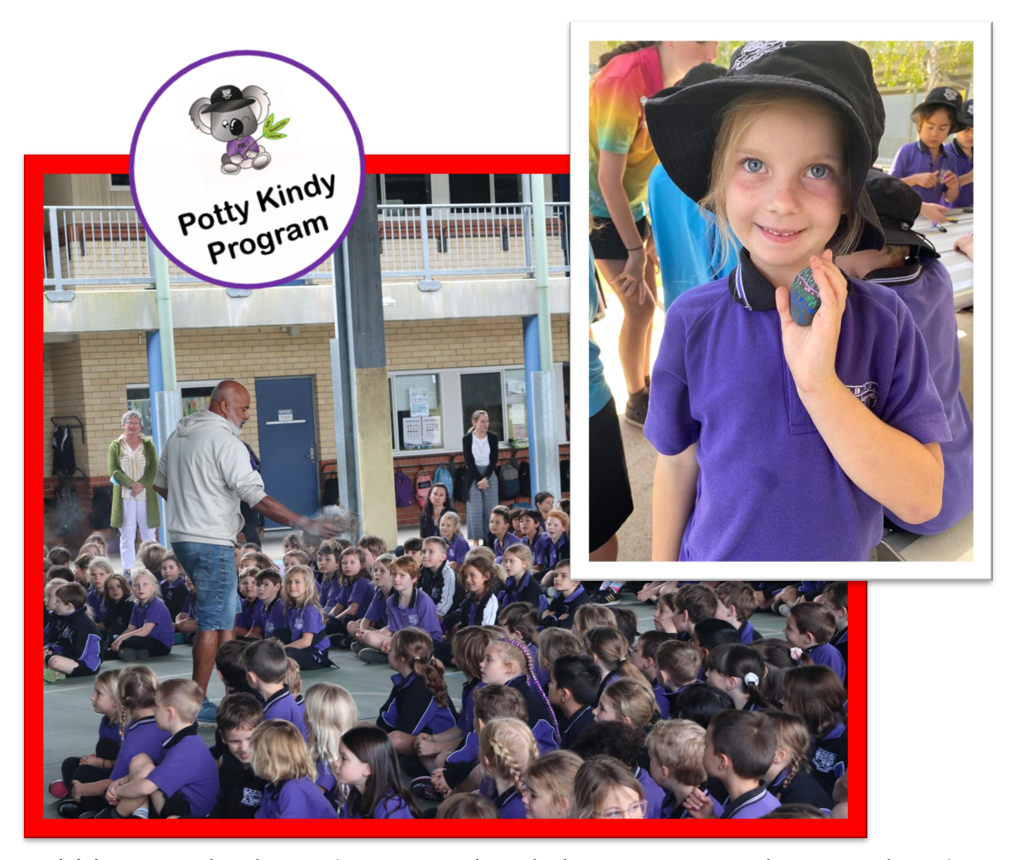
We are lucky at our school because we learn about First Nations history and culture. Through stories, dance, song, artwork and performance.

Did you know that our school is built on Bundjalung country?