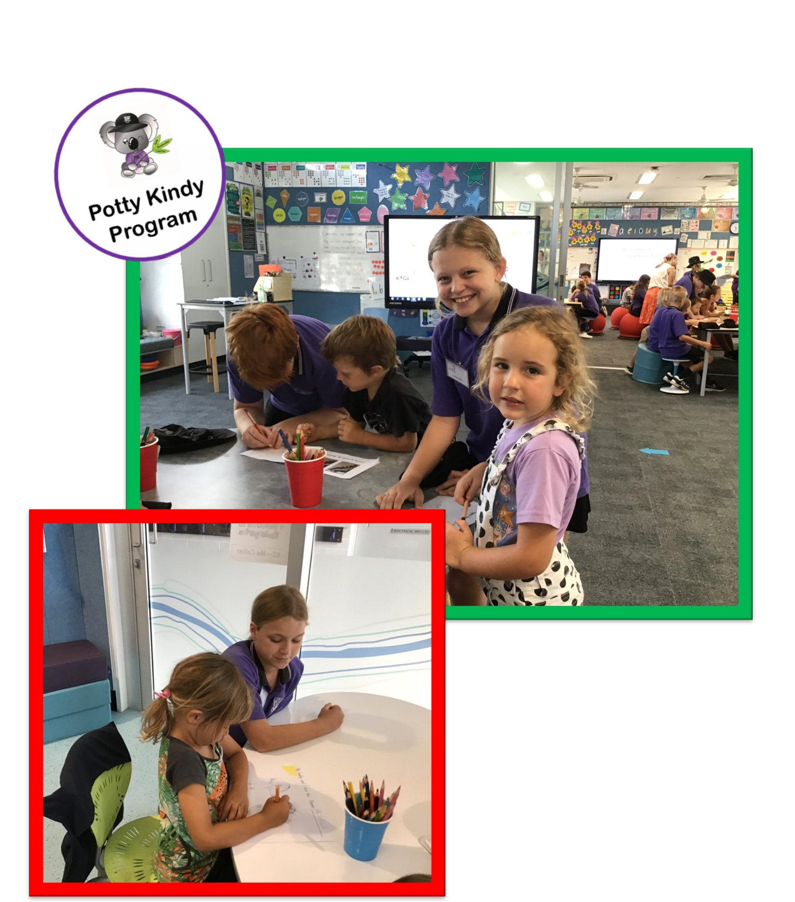
You will have two Kindergarten orientation days. You will start at 9:30am until 12:30pm.