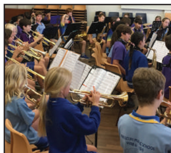
PBPS and Kingscliff PS bands

are overwhelmingly excited about these electronic editing tools.