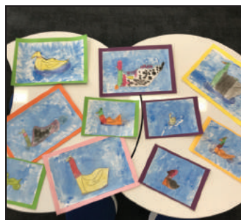
KC whats happening