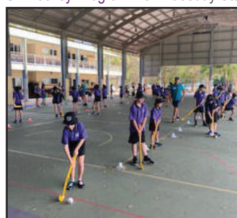
Stage 2 Hockey Skills