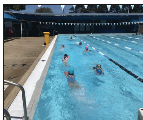
Intensive Swimming commences for Stage 1