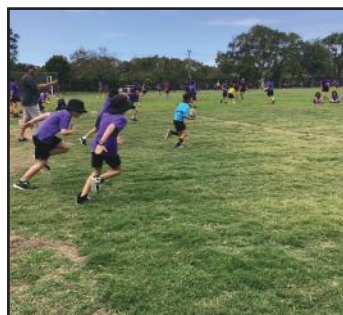
S2 Touch Footy