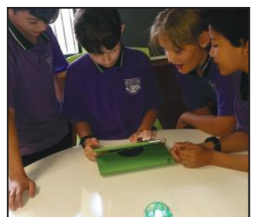
S3 STEM Day KHS