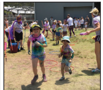
Colour Run fun