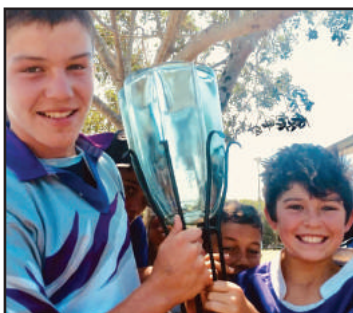
Casuarina Cup - Winners

Week 8 In Class Celebrations - All Stage 1 classes will be opening their rooms on Friday 6 December at 9.15am. On this morning parents will be given work to take home and have the opportunity to share some crunch and sip with their