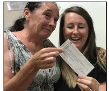
Lions Donation $250