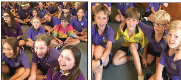
Voice Ensemble - Count Us In

Singers in the Year 4 and Stage 3 voice ensembles enthusiastically joined 750,000 learners around Australia, as part of the 'Music Count Us In' program.