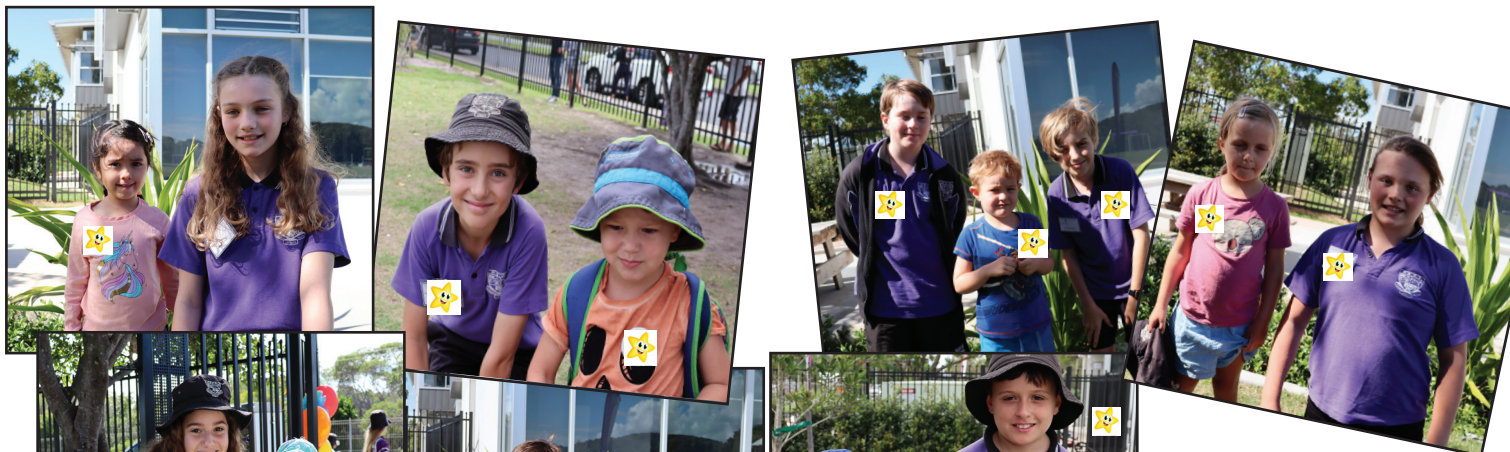
KTP - 2021 kindy students and their buddies