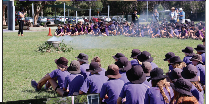
NAIDOC Week smoking ceremony