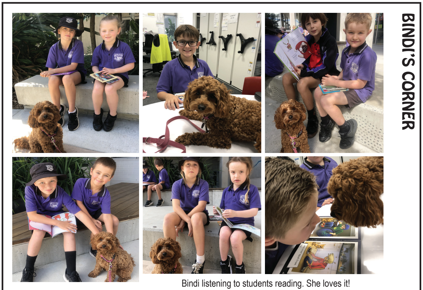
Bindi listening to students reading. She loves it!