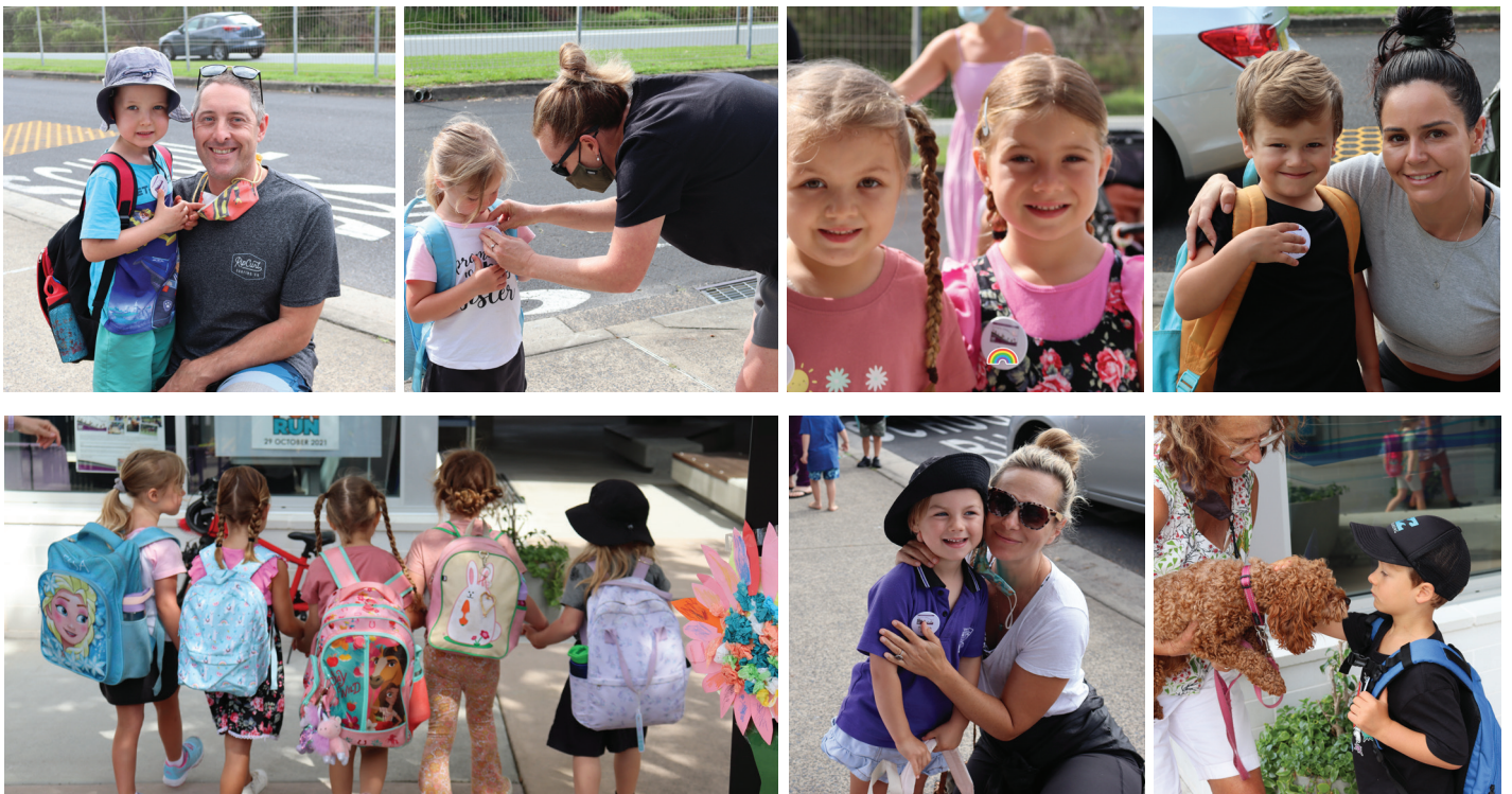
Kindergarten Transition Program