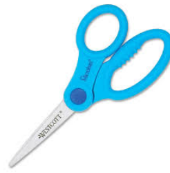
Scissors approx. 17 cm rounded ends