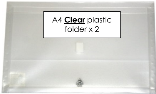
A4 Clear plastic folder x 2