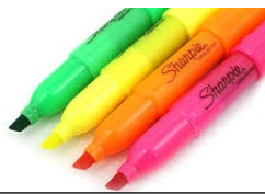
Highlighters pack of 4