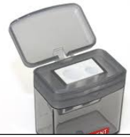
Enclosed sharpener x 1